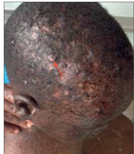
Fig. 3. Xeroderma pigmentosum in an 11-year-old child who developed SCC on the scalp.