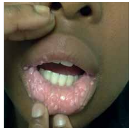
Fig. 2. Heck's disease, a variant of oral warts.